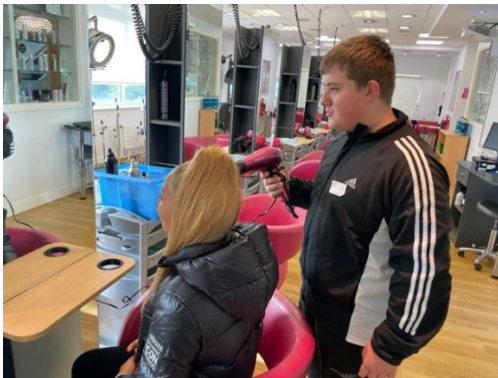
Hair & beauty