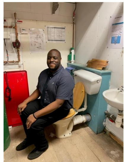
checking out the plumbing!